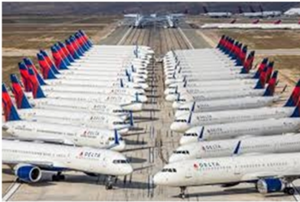
© 2020 Gogo LLC. All trademarks are the property of their respective owners. -PROPRIETARY AND CONFIDENTIAL-

>6,000 aircraft (incl. 1,124 2Ku) are parked; older aircraft will be retired